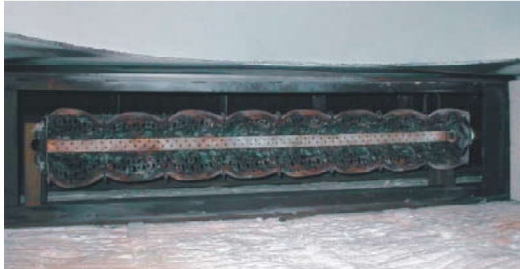
Burner in good condition

The mixing plates attached to the burner manifold are considered “consumable” and have been known to last anywhere from 2 years to 10 years. They will need to be replaced as required. Please note that these plates will warp and crack somewhat during normal use and still be perfectly fine.