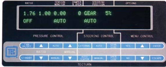
Obsolete item: Soft - Touch Keypad and Mother Board