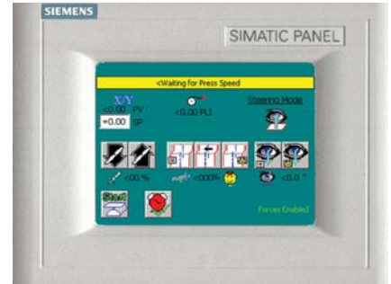
Replaced with: Siemens S-7 PLC Controls