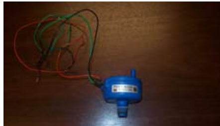
Before (obsolete kavlico transducer)