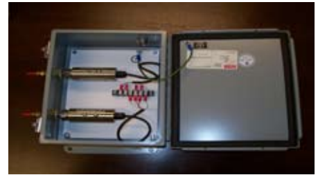
After (new-spectre 1000 enclosure kit)