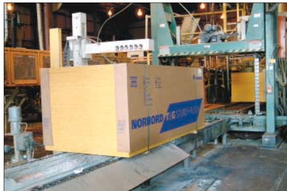
Norbord T&G Sturd-I-Floor is strapped at Signode station.

four-head Siemplekamp forming line and 12-opening caul-less press. Two Konus oil burners heat the thermal oil for the press. Norbord modified the heat energy system here to improve efficiency and safety. Engineering the redesign involved additional valving and piping modifications to automate the cooling system in the event of a power outage.