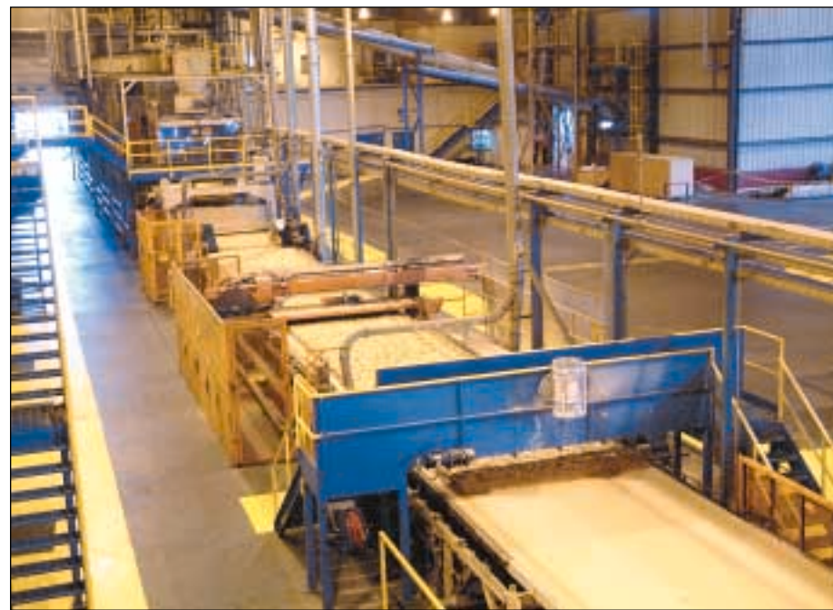
Top, MEGTEC supplied RCO units off the 12-opening press; above, forming line

People feared the worst the day the plume disappeared from the stacks at Norbord's oriented strandboard (OSB) plant, which is located near the heart of the city's business district. In their