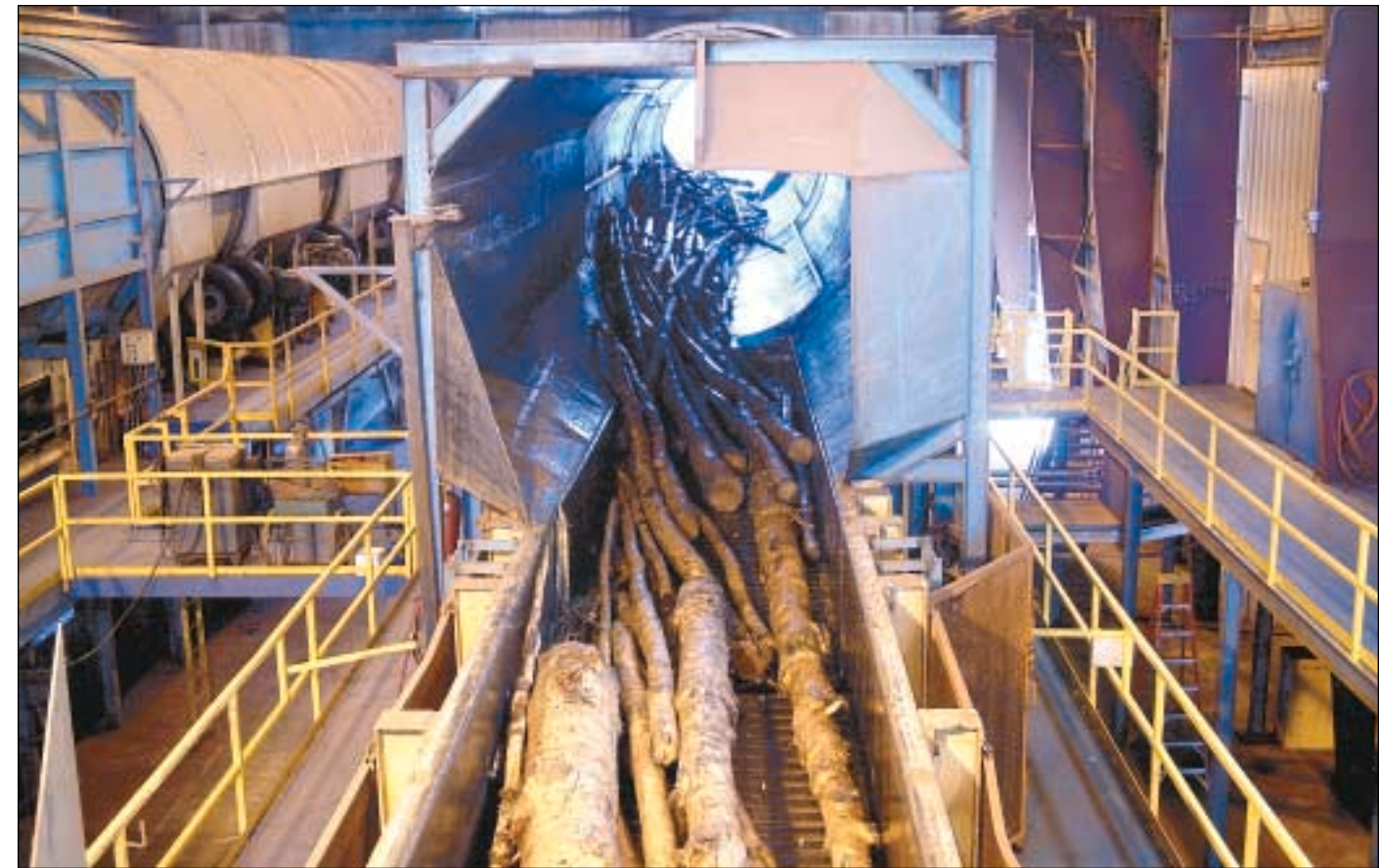
Southern pine logs move through drum debarker.