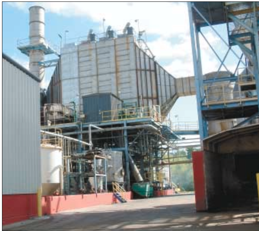
United McGill assisted in WESP enhancements.